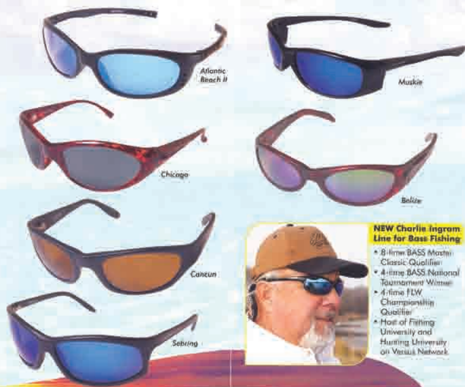
Atlantic Beach II